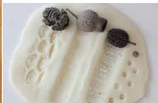
make an impression with nature's stampers