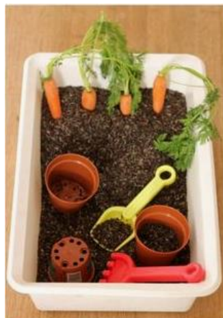
Spring Sensory Play